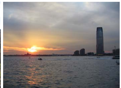
How about a sunset view in New York?